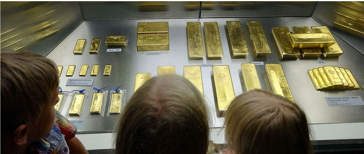
Kansas City Federal Reserve Bank and National Money Museum: See how the Bank processes millions of dollars in currency each day, lift a real gold bar, view the historic Harry S. Truman coin collection and enjoy fun, interactive exhibits while learning about the U.S. economy.