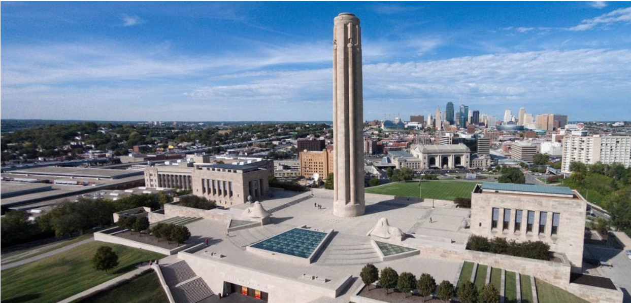
Liberty Memorial and National WWI Museum: America's official World War I museum and memorial, located in Kansas City. Home to the most comprehensive collection of WWI objects in the world.